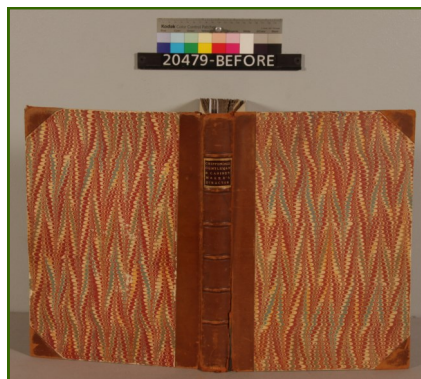
Before treatment: Notice the worn spine