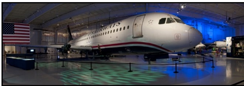
U.S. Airways Flight 1549.

NCPC welcomes new member Carolinas Aviation Museum . Located in Charlotte, North Carolina, the museum focuses on the history of aviation and highlights historic examples of civil, commercial and military airplanes and