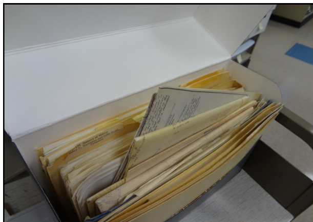
Collections at the Mercy Heritage Center are examined to determine necessary housing and preservation work.

In the midst of the moving process, Mercy Heritage Center's archivists have begun an assessment project to address the needs of each incoming collection, with the goal of streamlining workflow for future preservation projects.