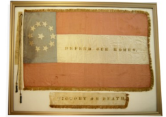
"Stars and Bars" from the James Library, Rockingham Community College

Civil War Letters is an online collection of manuscripts from the Western Carolina University Hunter Library. The letters from soldiers, their families and friends date primarily from 1862-1863.