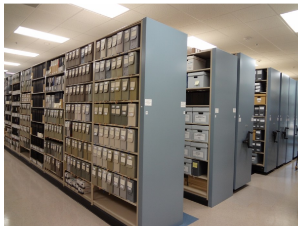
Mercy Heritage Center stacks.