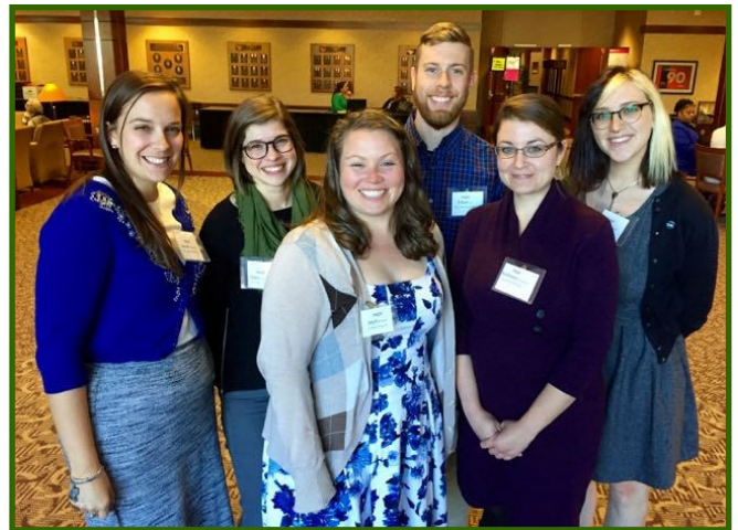
NCPC Annual Conference scholarship recipients. Left to right:

“Unbroken Threads: Preserving Our Textile Heritage” was the theme of the November 7, 2016, Annual Conference. Six presenters, including four from North Carolina, shared their tips on and experiences with working with textiles. NCPC presented the Preservation Excellence Award to the Iredell County Public Library Digitization Project.