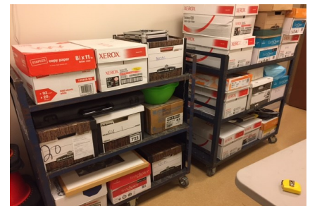
NCPC records ready for sorting.