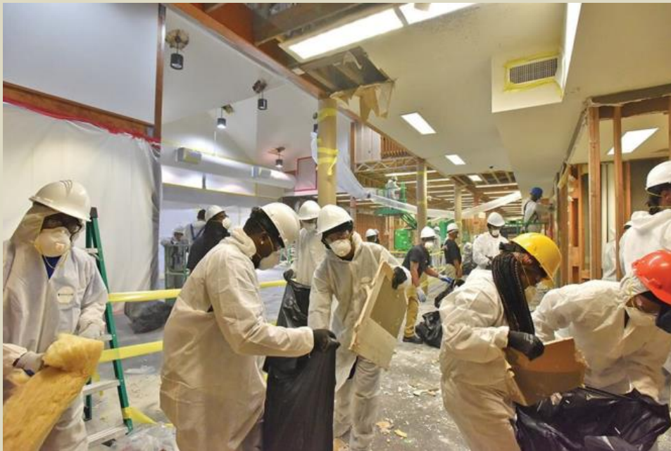
Core Sound Waterfowl Museum in the wake of Hurricane Florence, September 2018